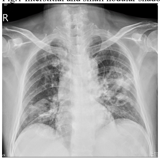
Fig.1 Interstitial and small nodular shadows over bilateral lungs