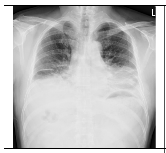
Figure 1. Chest X-ray showed bilateral consolidation in the bilateral lower zone.