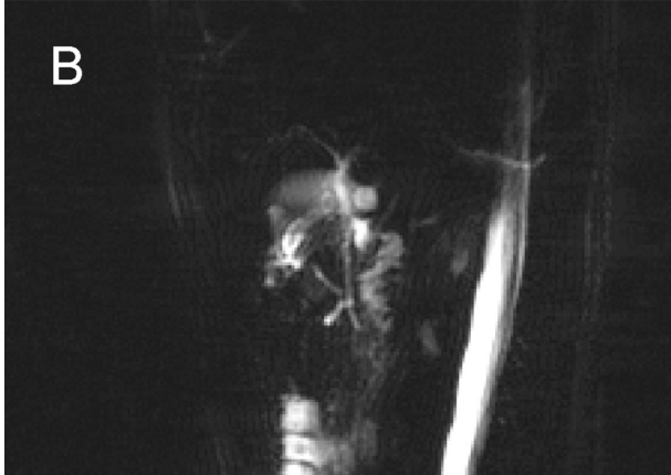
Fig.1.MRCP (PA view, A, and lateral view, B) showed non-opacification of the ventral duct and dilatation of the dorsal duct that communicated with the main pancreatic duct and drained into the minor papilla.

regular abdominal sonography for ten months without any signs or symptoms.